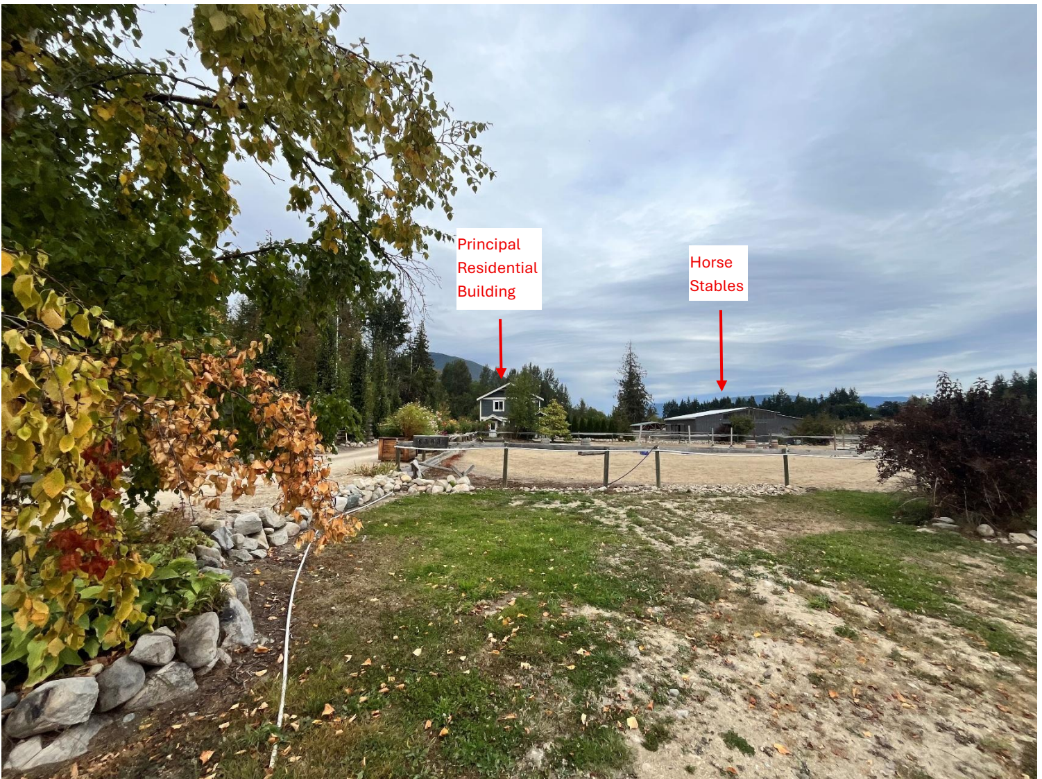
1. View of subject property from 1 Avenue NW – facing north.