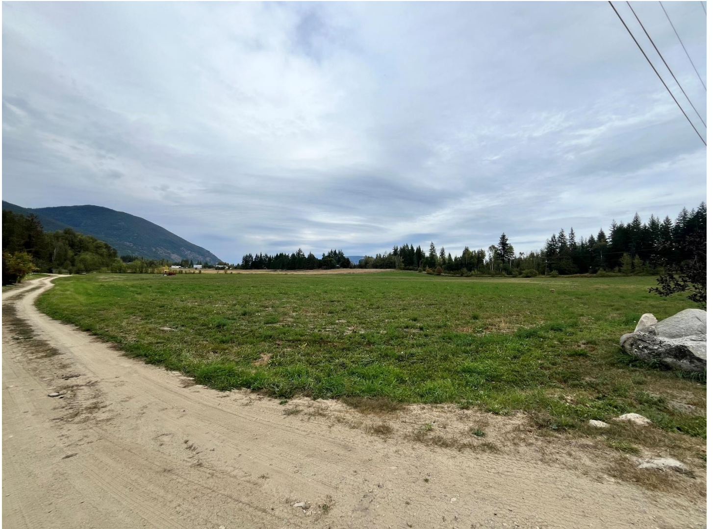
5. View from 1 Avenue NW – facing northeast.