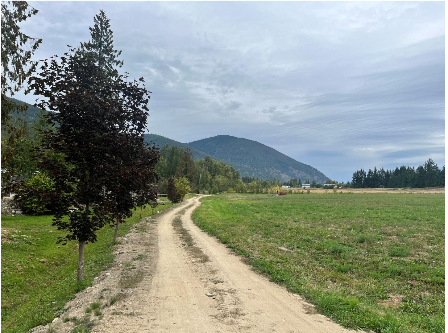
3. View from 1 Avenue NW – facing north.