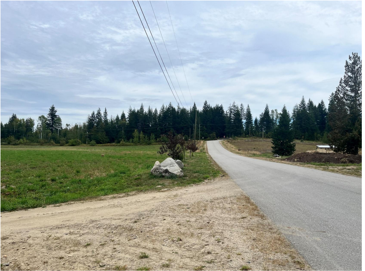
4. View from 1 Avenue NW – facing east, towards 50 Street NW.