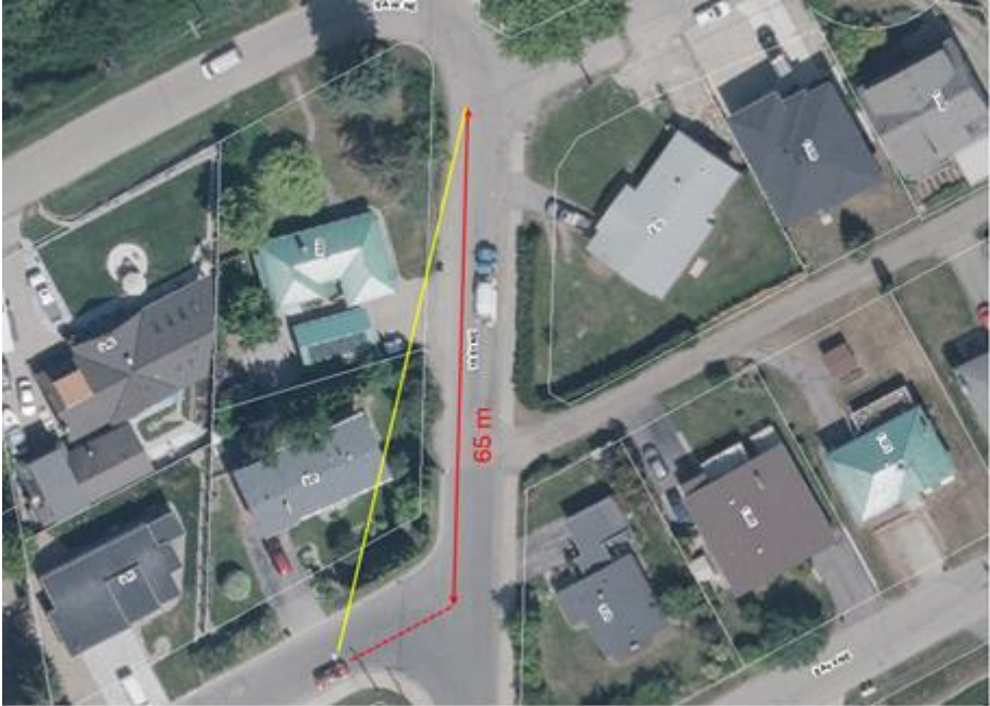
Sightline Requirements 50 km/h design speed = 65 m sightline

The TAC (Transportation Association of Canada) sightline standards govern the minimum unobstructed visibility at this intersection. Based on minimum decision time , this is the time it takes for a driver to react to an issue and bring their car to a full stop , safety standards cannot be achieved at this intersection, and the requested removal is already a reduction in the required TAC sight lines.