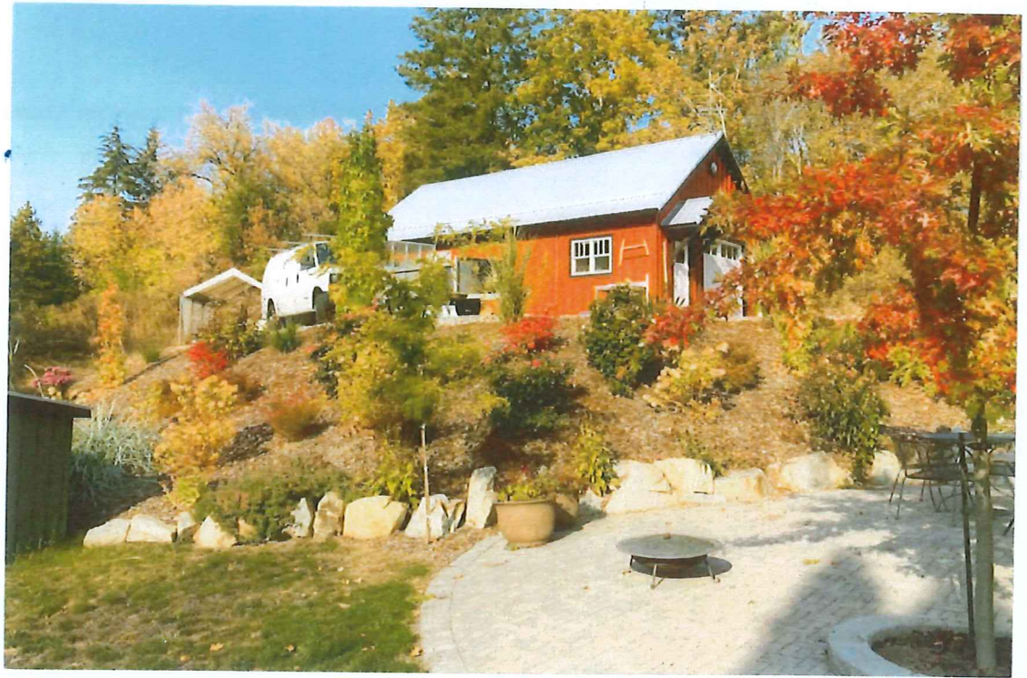
Existing garage and steep slope looking northwest from the subject property.